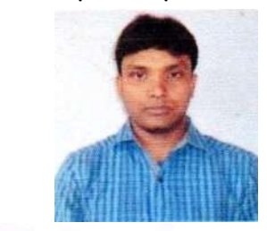
Bixarch Estate Bangal

The Controller of Examinations NETAJI SUBHAS OPEN UNIVERSITY 134/1, Meghnad Saha Sarani Kolkata - 700 029